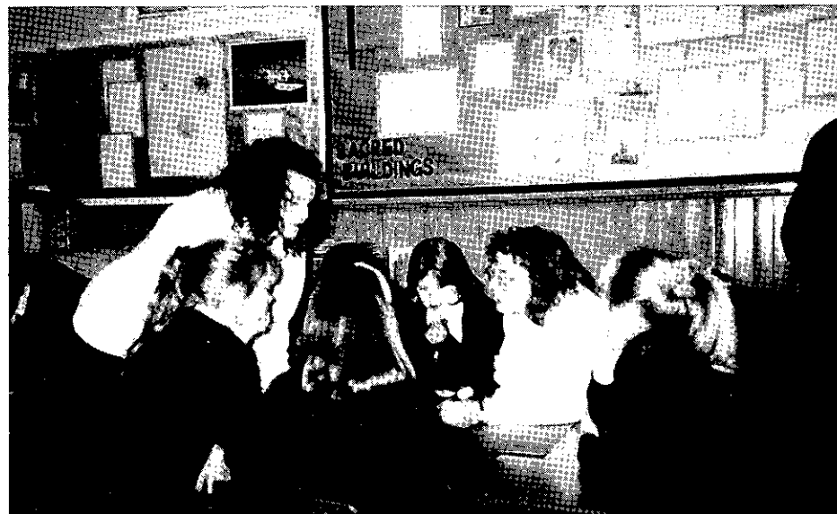
Top: Group discussion at the beginning of the weekend. Middle: A rap — recording the piece. Lower: One of the Stub Club members working with primary pupils

municate effectively their purpose. It was decided that they should produce some story boards and outlines.